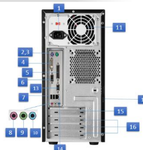
D310MT Rear View